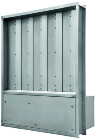
DAMPER FOR WALL INSTALLATION, WITH INTEGRAL ENCASED ACTUATOR