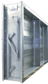
TUNNEL DAMPER WITH LINKAGE AND OPPOSED ACTION BLADES