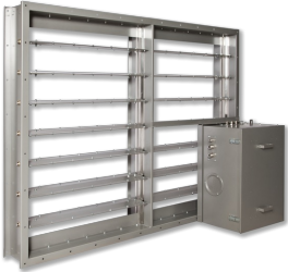
TUNNEL DAMPER TYPE JF-S