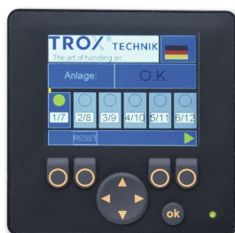
TNC-EC-AZM DISPLAY MODULE