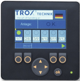
TNC-EC-AZM DISPLAY MODULE