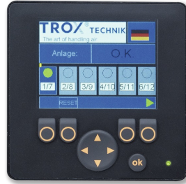
TNC-EC-AZM DISPLAY MODULE