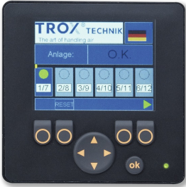
TNC-EC-AZM DISPLAY MODULE