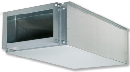
SECONDARY SILENCER TYPE TS