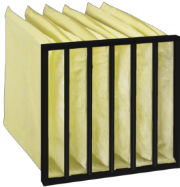
POCKET FILTER, TYPE PFS