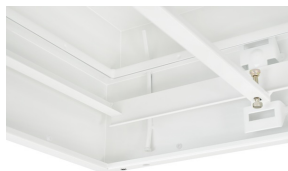
Internal measuring tube to sample particles for measurement