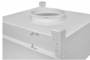
Circular spigot with lip seal