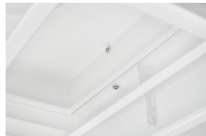
Pressure measurement point, detail