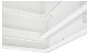
Test groove, detail