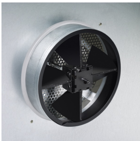
SPIGOT WITH DAMPER BLADE