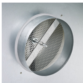
SPIGOT WITH ADJUSTABLE BAFFLE PLATE