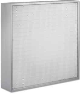
FHD &#X2013; CONSTRUCTION WITHOUT CENTRE MULLION