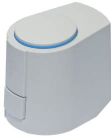
VALVE ACTUATOR FSL- CONTROL II