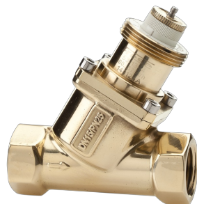
PRESSURE INDEPENDENT CONTROL VALVE