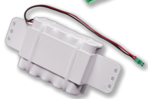
EXPANSION MODULE EM- TRF-USV