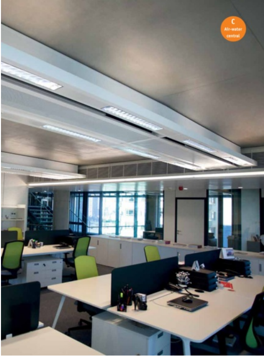
TMB Headquarters, Istanbul, Turkey

In rooms where high thermal loads prevail, air-water systems are the energyefficient alternative to all-air systems. Since they heat or cool the room air with air-to-water heat exchangers, the heating and cooling capacity can be provided independent of the required fresh air flow rate. Air-water systems may be installed 'openly', e.g. not concealed by suspended ceilings; a good example is the SMART BEAM, which was designed by Hadi Teherani. The most common installation, however, is in suspended ceilings.