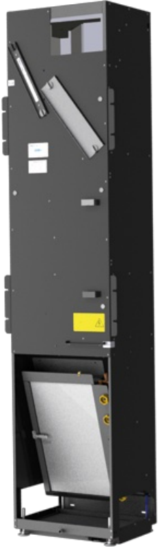
Vertical supply air and extract air unit FSL-V-ZAB with heat exchanger and heat recovery bis 42 l/s bis 150 m 3 /h B: 396 mm H: 1.800 mm T: 319 mm