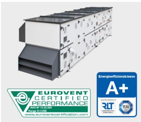
X-CUBE AIR HANDLING UNIT

Plastic and ATEX constructions are also available.