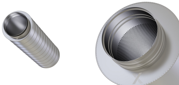
Spigot with groove