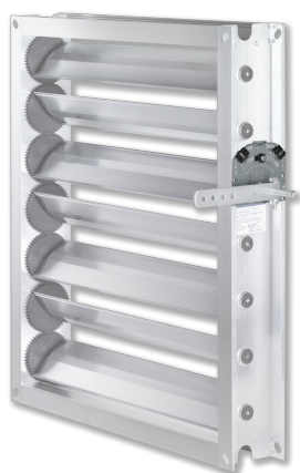
QUADRANT STAY FOR JZ-AL