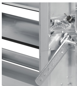
QUADRANT STAY WITH

The quadrant stay is situated on the first blade from the top (dampers with up to three blades) or on the third blade from the top (dampers with at least four blades)