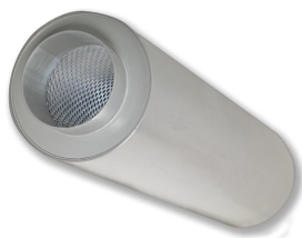
CIRCULAR SILENCER TYPE CAK